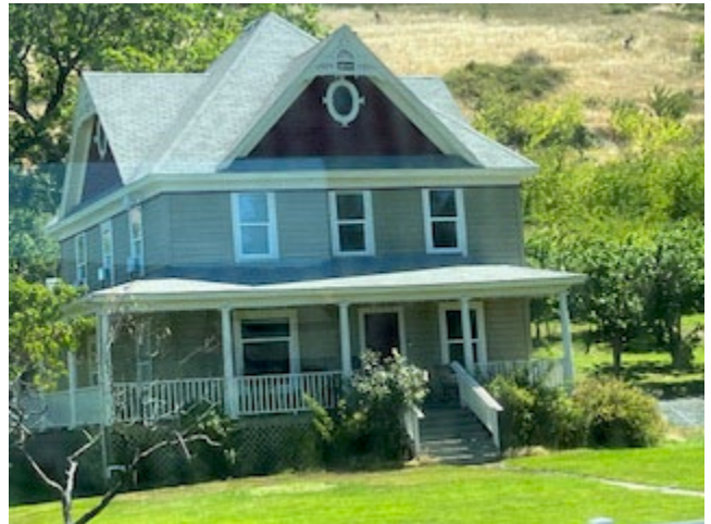
Beautiful Old Home near the Pear Orchard