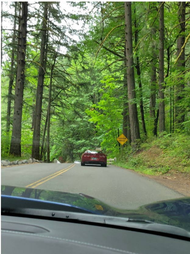
Going Toward Hood River