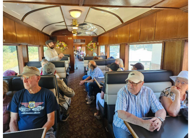
On the Train