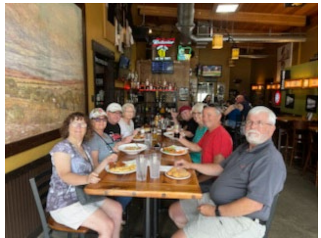
Lunch on the way Home The Dalles