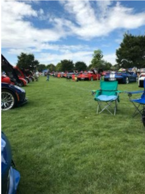
Vette fest Boise, Idaho