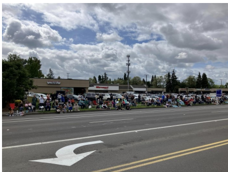
The Keizer Iris Parade was held on Saturday, May 18th and was celebrated along with the 40th year since the St Helens volcanic eruption.