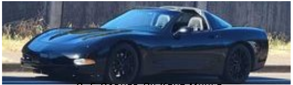
C-5 CORNER BY KENT MUHLE