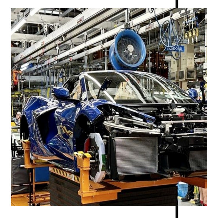
The Potential Upcoming Strike? Will It Happen?

that entire month. Yet, some of the custom VIN option cars (those with custom VINs that GM approved), are now moving forward in some fashion.