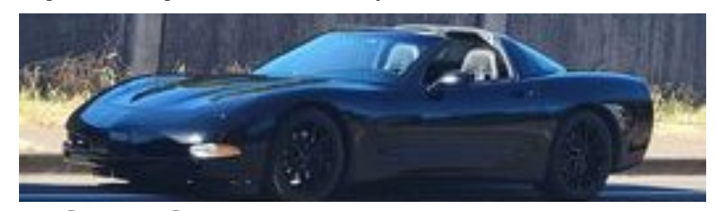
C-5 CORNER BY KENT MUHLE