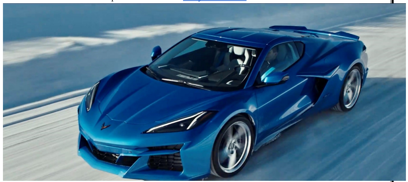
2024 E-Ray

*2024 Standard Features & Option Order Guide bit.ly/3YaGWSc