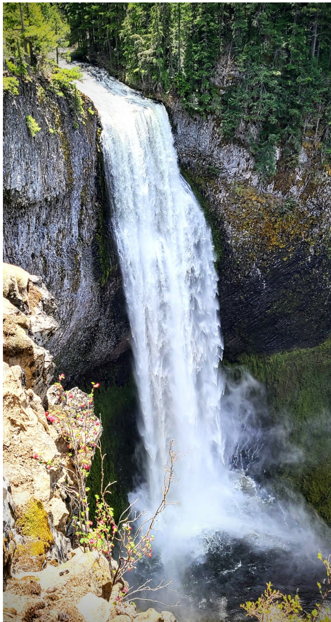
Salt Creek Falls from the May 15th cruise