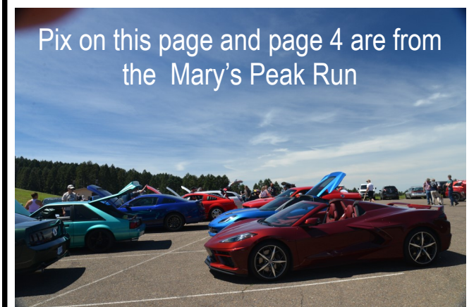
Pix on this page and page 4 are from the Mary's Peak Run