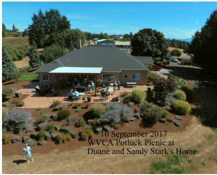
10 September 2017 WVCA Potluck Picnic at Duane and Sandy Stark's Home

The annual Club Picnic was held on Sunday the 10th of September at the beautiful home of Duane and Sandy Stark. It is a perfect setting for the picnic and the grounds are beautiful with horse stalls and cattle, believe it or not!