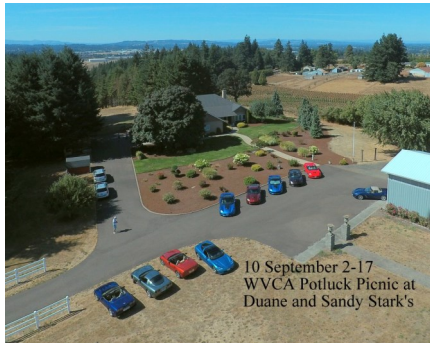
10 September 2-17 WVCA Potluck Picnic at Duane and Sandy Stark's