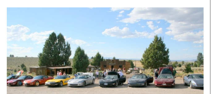
Willamette Valley Corvette Association Cowboy Dinner Tree tour August 7, 2010