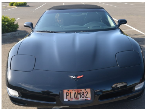
Gary and Phyllis Whelchel have a Black C6 Roadster and have been members since 2015