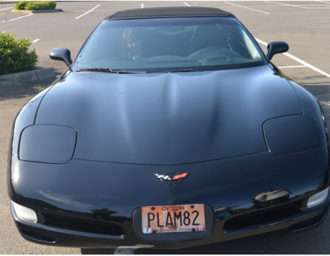
Gary and Phyllis Wheelchel have a Black C5 Roadster and have been members since 2015