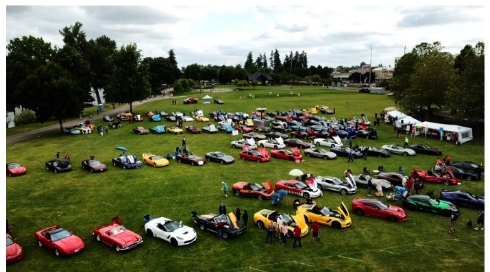
Some great drone pics from last Summer